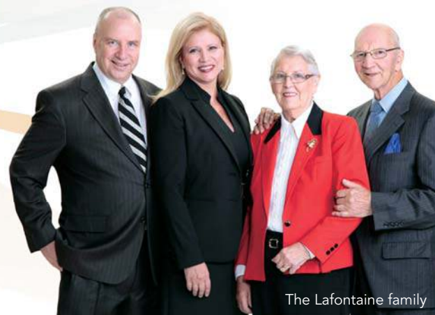
The Lafontaine family