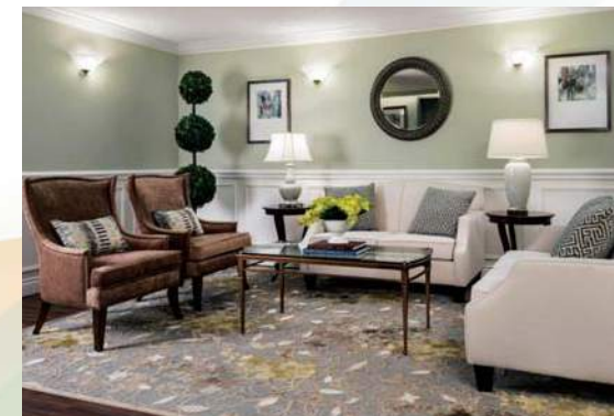
Spacious common areas.